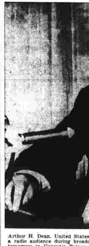
Arthur H. Dean, United States delegate to renewed three-nation nuclear test ban talks, addresses a radio audience during broadcast interview in Geneva today.

Moscow, Nov. 27 (AP)—The Soviet Union proposed today that the United States, Britain and France agree with it now to ban all nuclear tests.